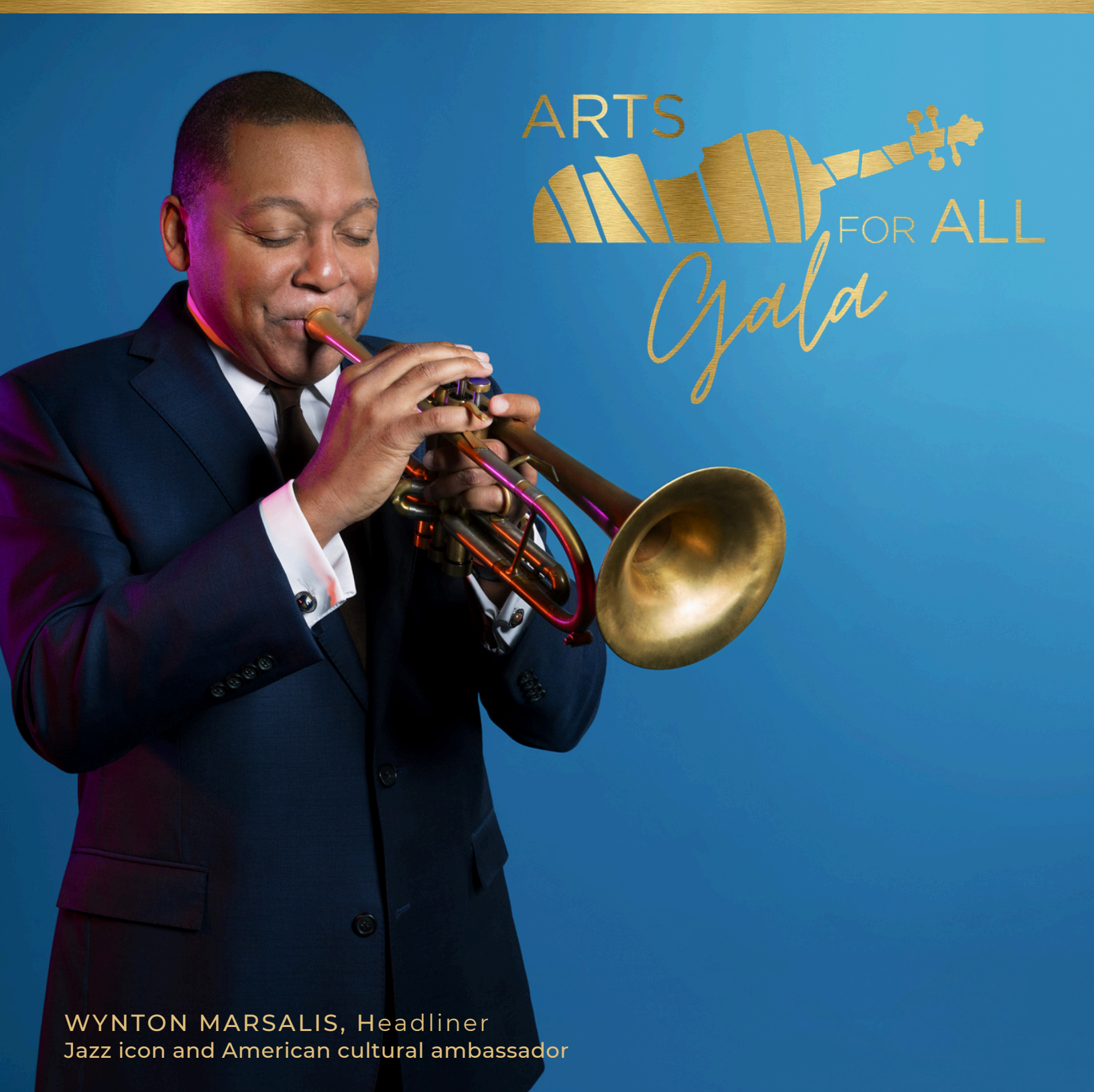
WYNTON MARSALIS, Headliner Jazz icon and American cultural ambassador