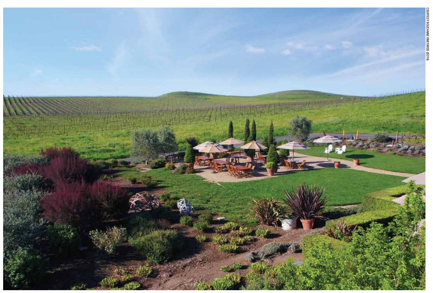
Bouchaine Vineyards, Carneros, California.